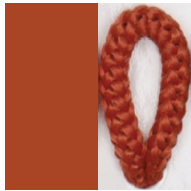
ARCILLA Pant. 1675C 150