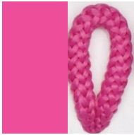
FUCSIA Pant. 212C 267