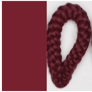
BURDEOS Pant. 188C 163