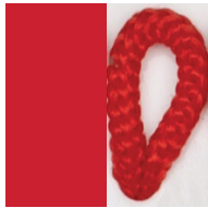
ROJO Pant. 186C 241