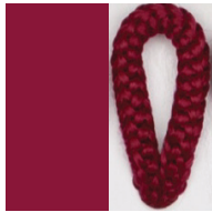
S- MAROON Pant. 1955C 224