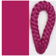
PURPURA Pant. 215C 276