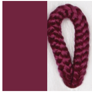
CLARETE Pant. 209C 240